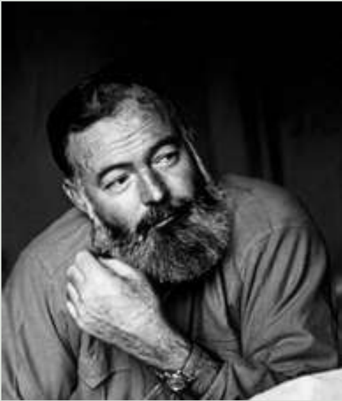
Ernest Hemmingway “The Capital of the World”