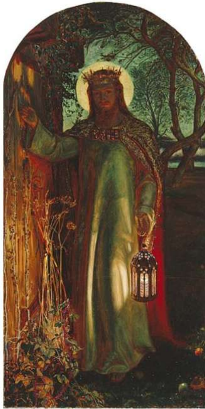
On Display at Manchester City Art Gallery