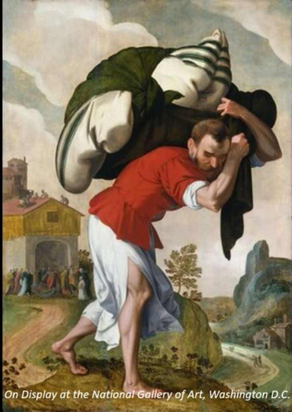
On Display at the National Gallery of Art, Washington D.C.