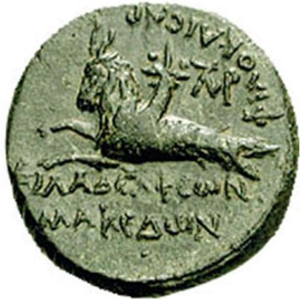
Coin from Philadelphia. Roman Provincial Coinage , 3031.4