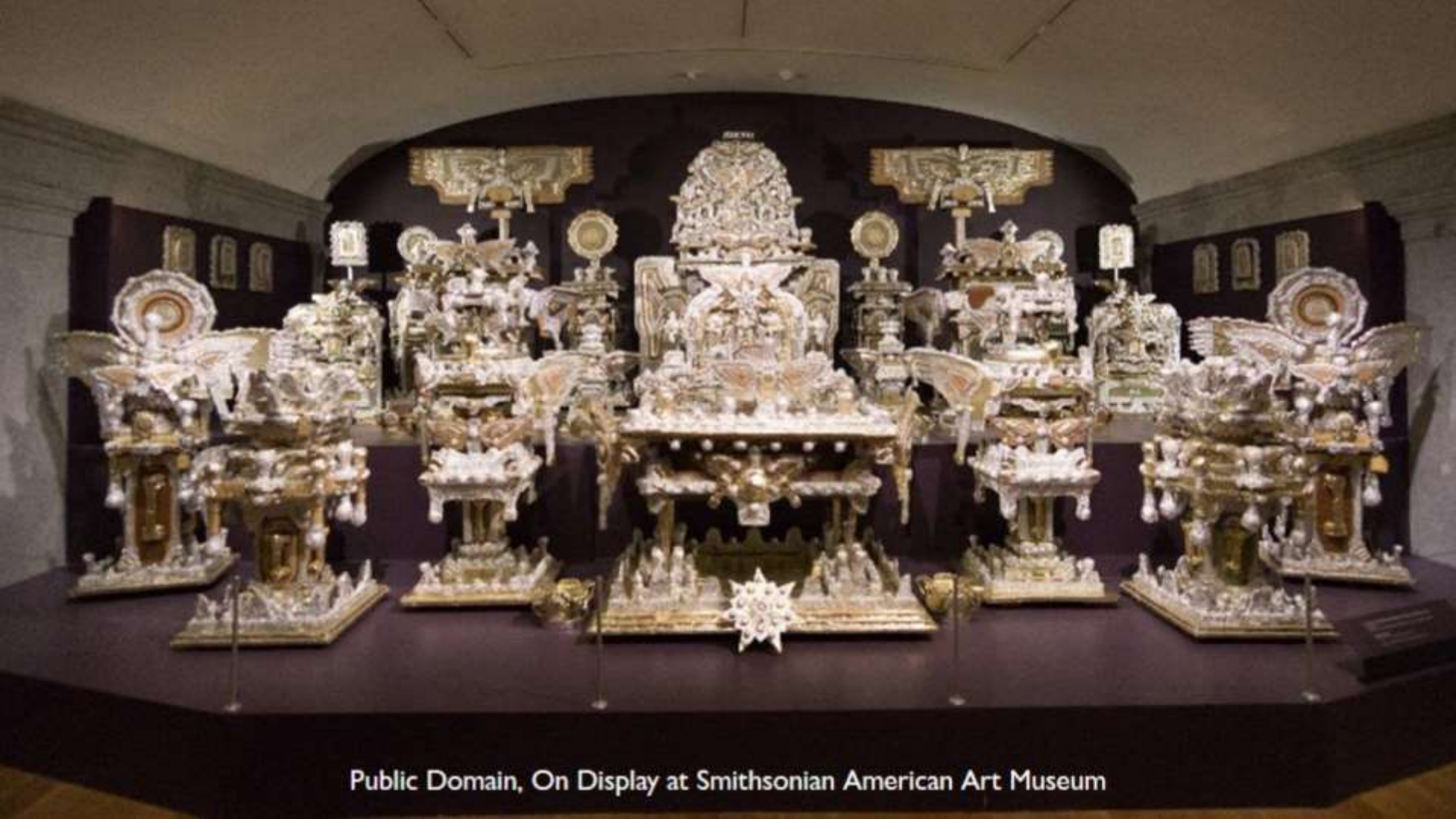
Public Domain, On Display at Smithsonian American Art Museum